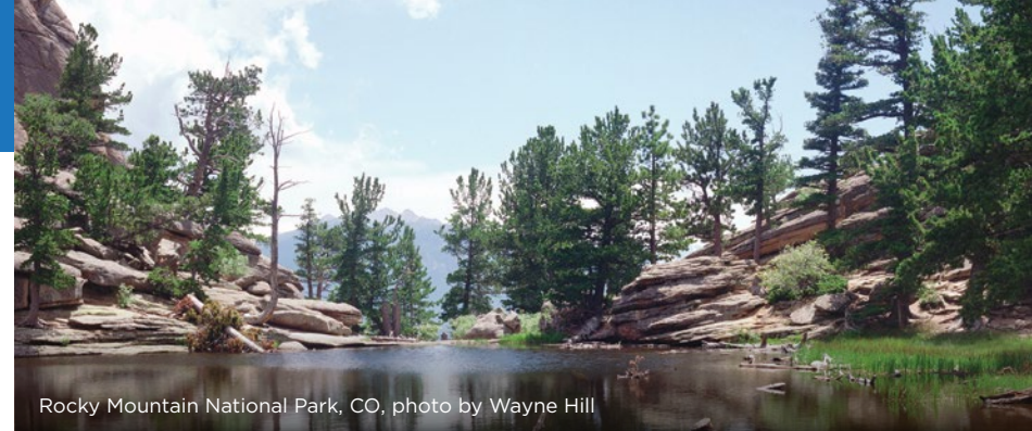
Rocky Mountain National Park, CO, photo by Wayne Hill

Our complete audit and IRS 990 are available on our website. Visit parktrust.org , and click "About Us."